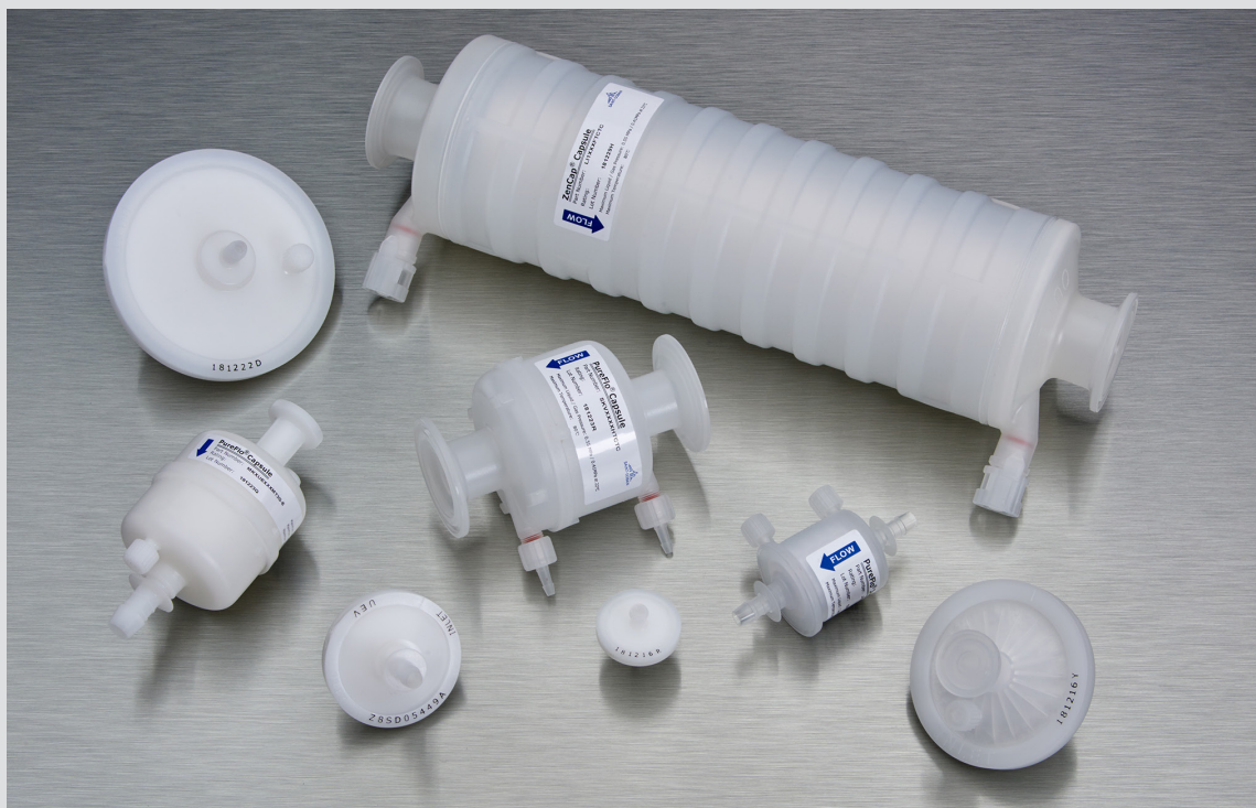
PureFlo®, ZenCap®, and ZenFlo® are registered trademarks of Saint-Gobain Life Sciences

Uncontrolled Document - for the controlled version of this document please visit www.biopharm.saint-gobain.com