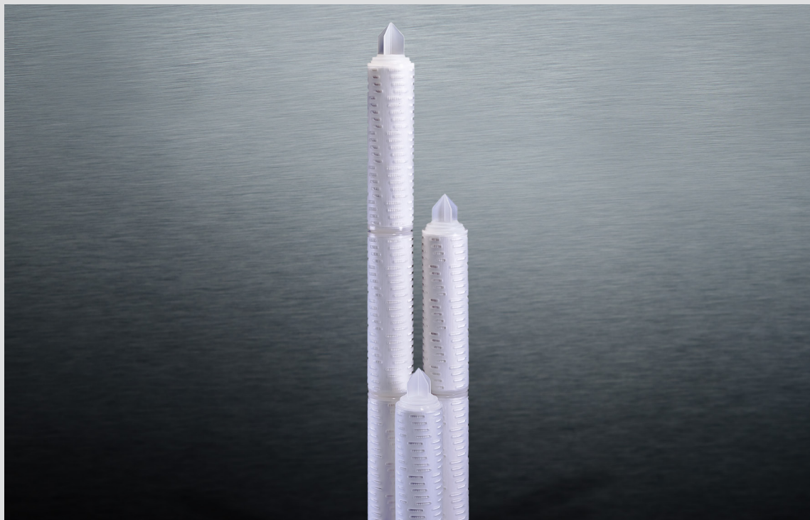
PureFlo® is a registered trademark of Saint-Gobain Performance Plastics

Uncontrolled Document - for the controlled version of this document please visit www.biopharm.saint-gobain.com