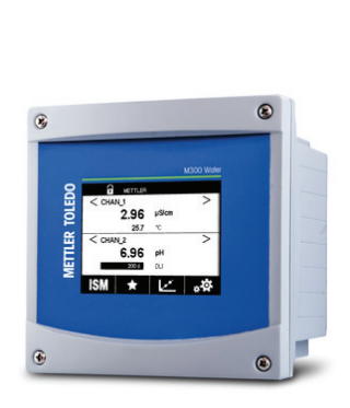
Product based on the M300 Process Transmitter Series with brilliant high contrast black & white touchscreen interface

The touch screen is a brilliant four inch TFT that gives clear display of important measurement information. It has a user friendly menu structure and quick access to settings. The enclosure is sealed water-tight to protect internal electronics. The probes connect conveniently to the wired connectors at the front. The power and analog outputs connect to the bottom panel and the power supply is included.