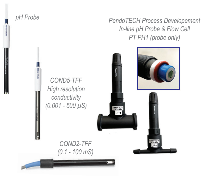
A variety of pH and conductivity probes can be used