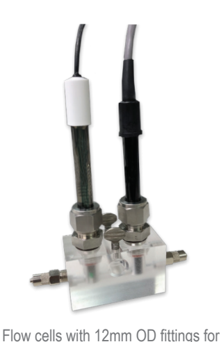
probes for inline measurement