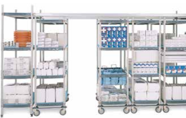
MetroMax i® Top Track® Storage System with Microban® Protection