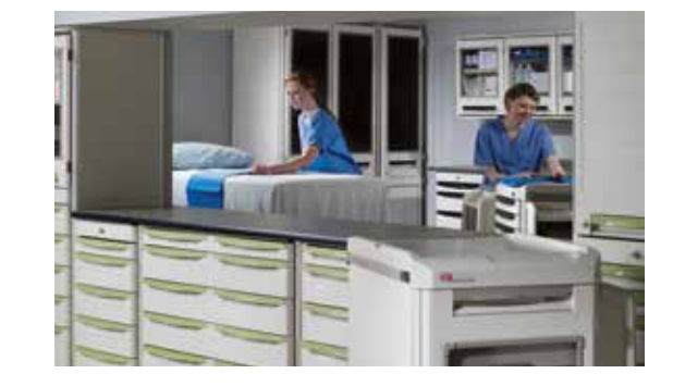
Starsys® Modular System for the O.R.