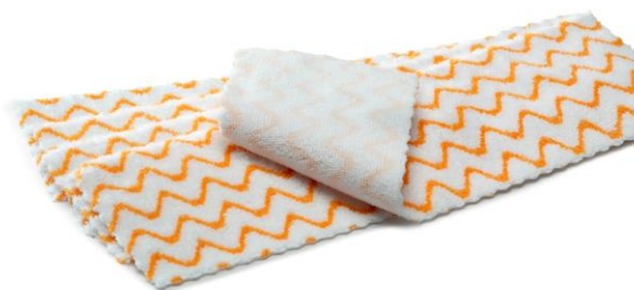
A Disposable Microfiber H&L Flat Mop that delivers Performance

The only pH neutral Cleaner & Disinfectant safe for use in all Animal and Human environments